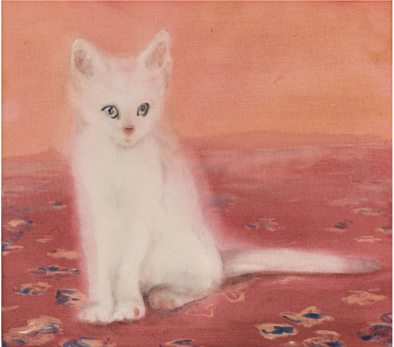
Freyja , 2024 Acrylic on canvas 41 x 46 cm $3,500 incl. GST