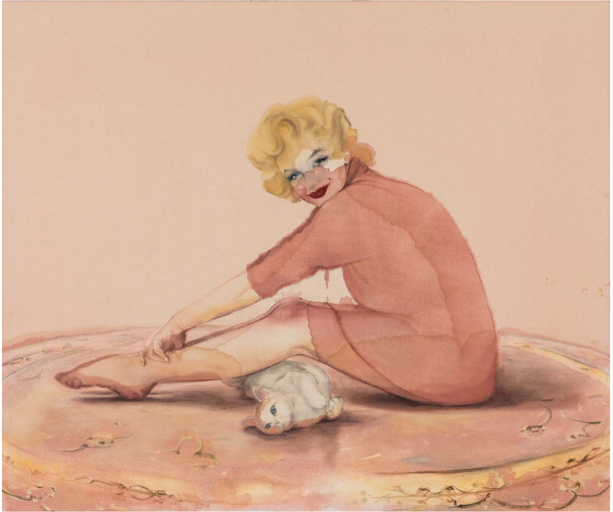
Goddess , 2024 Acrylic on canvas 102 x 122 cm $9,000 incl. GST