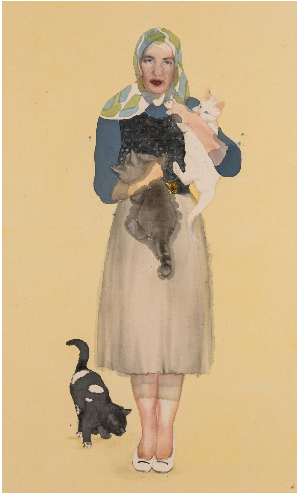
S-T-A-U-N-C-H , 2024 Acrylic on canvas 126.5 x 76.5 cm $7,500 incl. GST