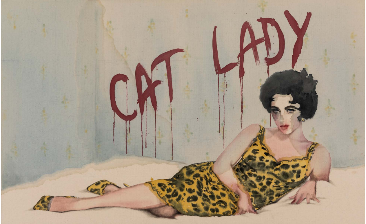
Worshipped , 2024 Acrylic on canvas 76 x 122 cm $7,000 incl. GST