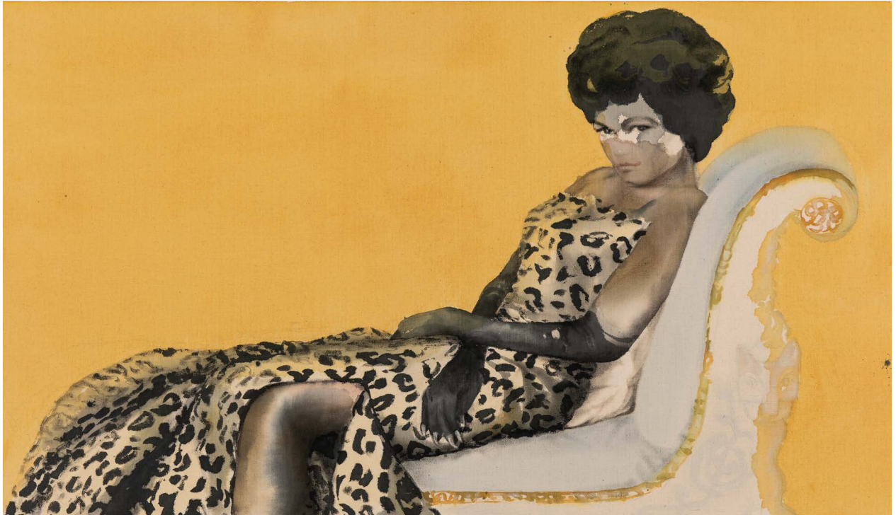
Pride, 2024 Acrylic on canvas 66.5 x 114.5 cm $6,500 incl. GST